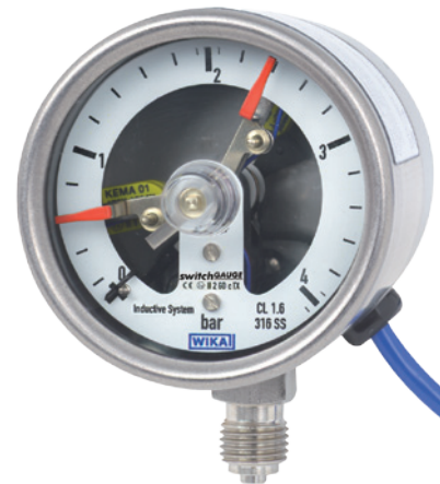
switchGAUGE model 232.30.063