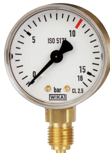
Bourdon tube pressure gauge model 111.11