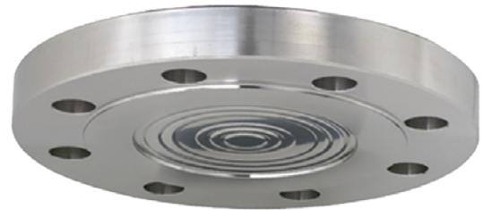
Diaphragm seal with flange connection, model 990.27

For further technical information on diaphragm seals and diaphragm seal systems see IN 00.06 "Application, operating principle, designs".