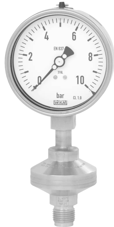
Diaphragm Seal Model 990.34, Mb 52 mm process connection thread G ½ B (male), with Pressure Gauge Model 232.50 NS 100

See also diagram pressure-temperature rating on page 3