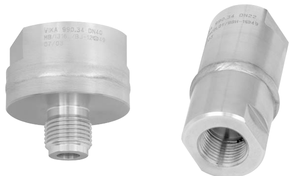
Model 990.34 Mb 40 mm thread G ½ B (male)