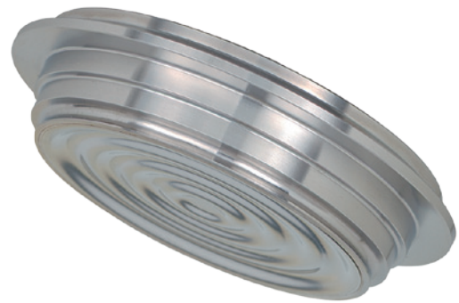
Diaphragm seal with sterile connection, model 990.24

The model 990.24 diaphragm seal with VARIVENT® connection is particularly suited for use in sterile processes